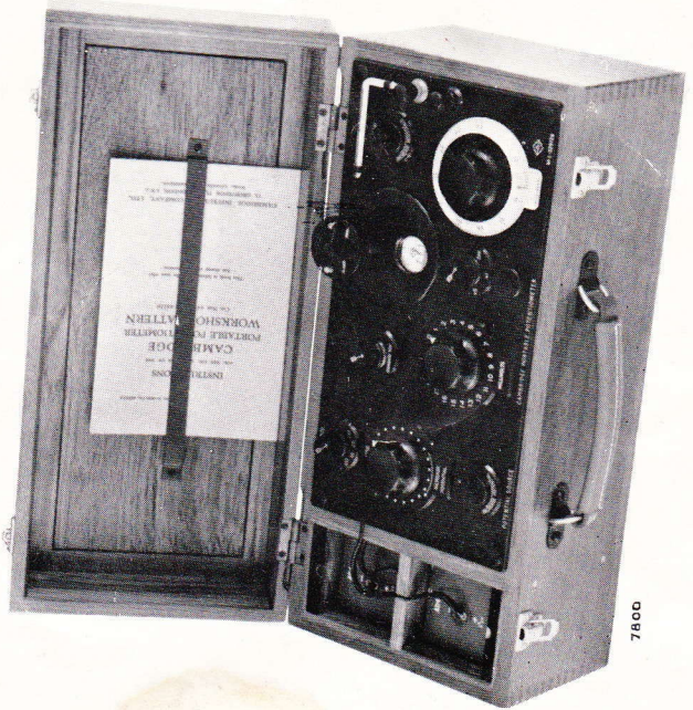
Fig. 2. Cambridge Workshop Potentiometer with Potential Source Cat. No. 44226